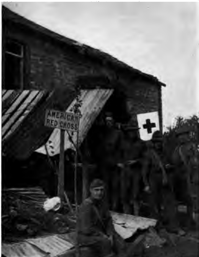
OUR RED CROSS AT THE FRONT A typical A. R. C. dugout just behind the lines